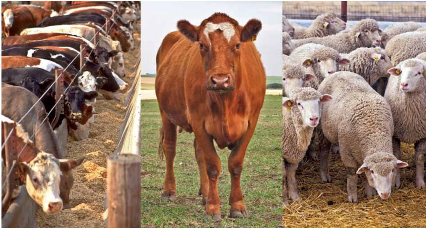
Various types of ruminants: feedlot cattle; beef cow; and sheep