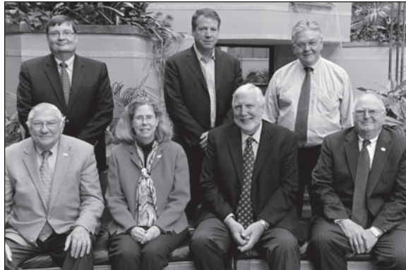
CAST 2011 Board of Trustees

Trustees who participated on this Board in 2011 included those named in the photo caption below.