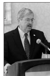
Governor Branstad speaking to CAST.