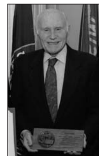
Senator Herb Kohl receiving the President's Award.