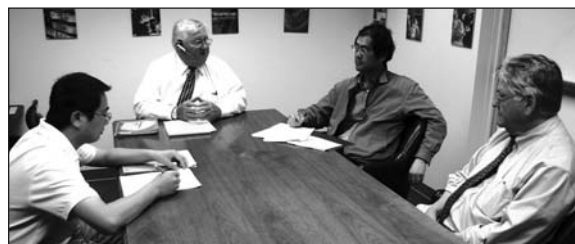
Chinese visitors to CAST.