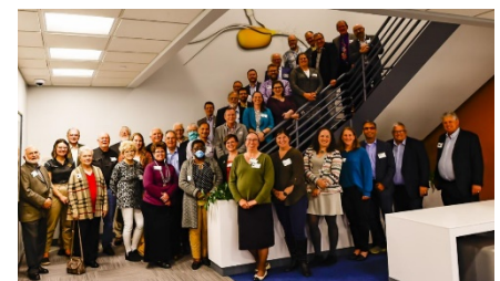
Annual Meeting attendees at Corteva.