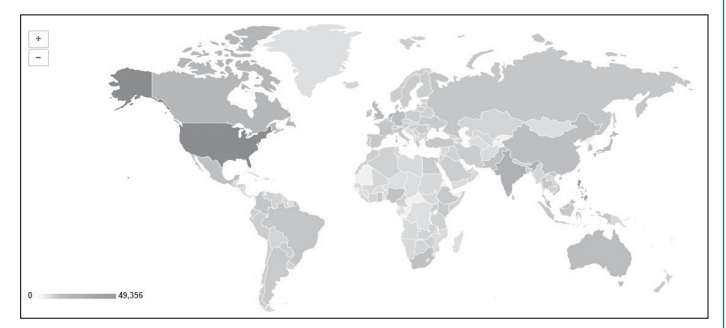
CAST's website received more than 83.2k views from all over the world in 2022.

Linkedin: linkedin.com/company/castagscience YouTube: youtube.com/CASTagScience Pinterest: pinterest.com/castagscience Website: cast-science.org