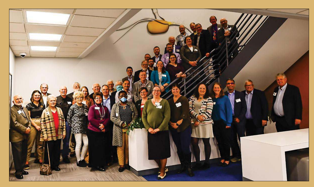
2022 CAST Annual Meeting attendees at Corteva.

CAST convenes and coordinates networks of experts to assemble, interpret, and communicate credible, unbiased, science-based information to policymakers, the media, the private sector, and the public.