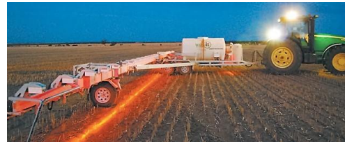
Zapping the weeds with precision.

Precision Weed Control: This infrared spraying technology supposedly detects and treats individual weeds using red lights, sensors, and a nozzle control system installed along the boom.