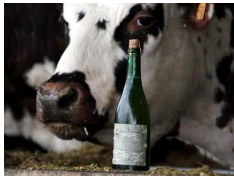
What? Me worry?

The Possibility of Avian Flu (opinion): Planning for epidemics, animal or human, is to a large extent based on what a disease did the last time-- prediction is difficult .