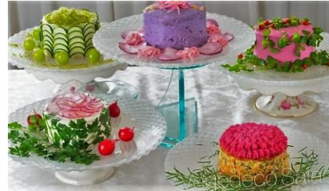
Veggies turned into food art.

Veggie Food Art: These Japanese foodies take veggies out of the salad bowl and reassemble them into colorful, meticulous, and eye-catching "cakes."