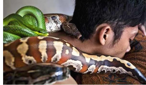
Snakes as foods, symbols, and controversies.

Pigs and Global Trade: Apparently, the Russian pig industry has managed to overcome the trade embargo with both the United States and the European Union by expanding its total amount of breeding animals.