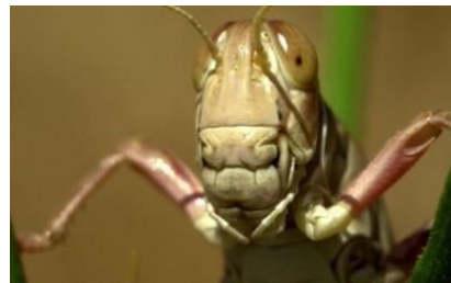
This French cricket looks like a grasshopper--but it all tastes the same in their insect spaghetti.

Too Close an Encounter with Insect Spaghetti? (video): This business in northeastern France is making pasta out of crickets .