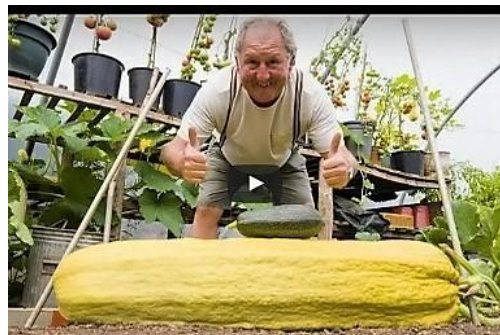
An industrial-sized squash for this British gardener.

FYI--FAQ about GMOs; YW (YAA)***: The Genetic Literacy Project provides this FAQ website focused on GMO labeling around the world.