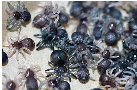
Baby tarantulas soon grow out of that "cute stage."

Hardware: Clayton Murphy, a small-town boy who grew up showing and selling pigs in Ohio, won a bronze medal in the Rio Olympics in the 800-meter run.