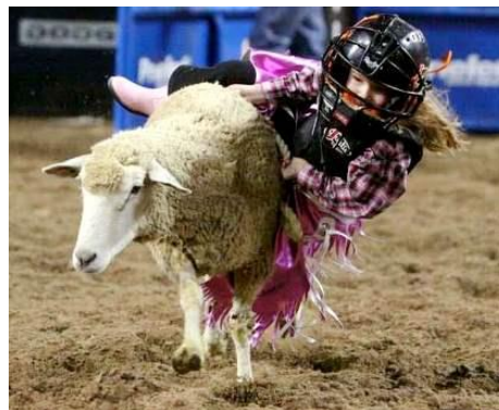
Even 5-year-olds like to experience a little woolly bully.

**Music to Your Ears--If You're Foghorn Leghorn: The chicken calling contest brings out a flock of interesting humans.