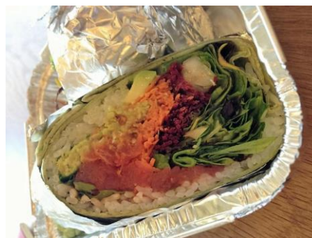
Gonna need both hands for this sushi burrito.

Paid Not to Milk? A Dutch dairy cooperative will pay its member dairy farmers to not produce milk during a six-month period as part of a phosphate reduction program.