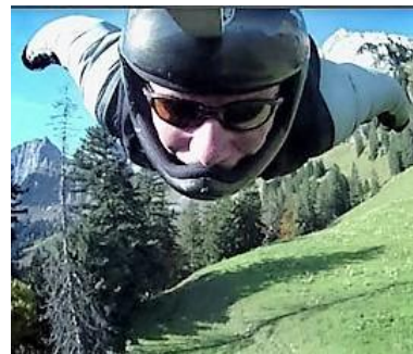
Fly like a free--and crazy--bird.

Forty-four Seconds of an Adrenalin Rush: This professional wingsuit BASE jumper uses a flight-stabilized helmet cam to take us on a hair-raising ride .