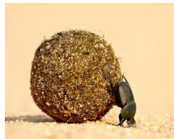
A dung beetle guttin' it out.

Surf's Up and the Power Is On: America's first wave-produced power goes online in Hawaii--the electrical current travels through an undersea cable to a power grid.